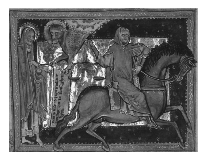
Figure 3 The Lambeth Apocalypse (with thanks to Lambeth Palace Library).

scripture. Origen returns to 2 Thess. 2:2 in Against Celsus 3.11, to verify the expectations of the resurrection of the dead and the day of the Lord.