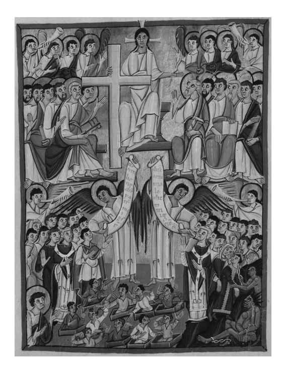
Figure 2 Bamberg Apocalypse: Christ in majesty as Judge, setting out for the final battle, with the praise from angels with trumpets, and elders in heaven (early 11th century) (with thanks to Staatsbibliothek Bamberg; Msc. Bibl. 140, fol. 53r; photo: Gerald Raab).

denotes those who deny Christ. The term does not occur explicitly in 1 and 2 Thessalonians, but Didachē 16:3–4 speaks of "false prophets" in "the last days," and of "the deceiver" who will do signs, although the Greek does not explicitly call this "Antichrist."